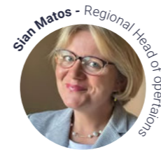
Meet the team